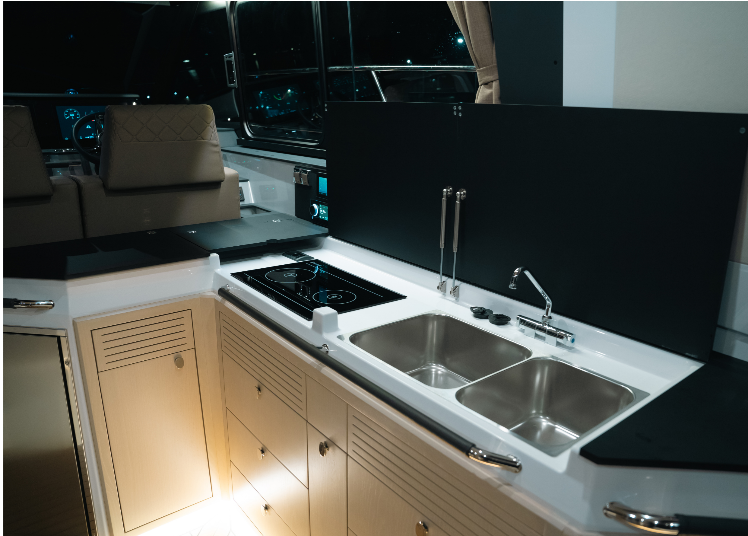
The galley on starboard side is well equipped and could be called a kitchen. Double sink and plenty of storage makes you feel like home. For sure a huge fridge to make sure you always have cold drinks available.