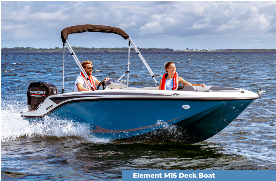
Element M15 Deck Boat