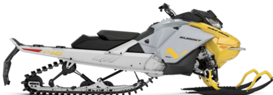
SUMMIT NEO SHOWN