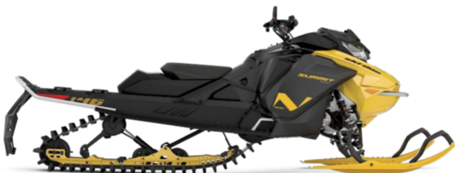
SUMMIT NEO+ SHOWN